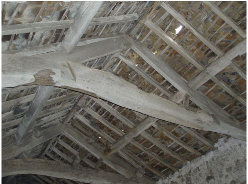
Figure 4 Renard Close Laithe: former cruck blades re-used in new roof trusses of 1667.

Heightening and extending is seen in other field barns. Renard Close Laithe, built at the edge of its meadow close, has documentary evidence for a 16th-century date. In 1582 James Rayner acquired the field closes here (Pacey 2015). One close already included 'a house standing' which is likely to be this building, with the field close now named after Rayner. In 1665 Cuthbert Wade had bought the Rayner property and must have set about modifying the old thatched cruck barn by heightening and adding a stone flag roof. 'CW 1667' is inscribed over the foddergang door. Wade seems to have made use of the old ashwood cruck blades and purlins for two new roof trusses (Fig. 4). The lap joint carpentry on four re-used cruck blades and some cruck purlins is well seen and the cruck structure fits