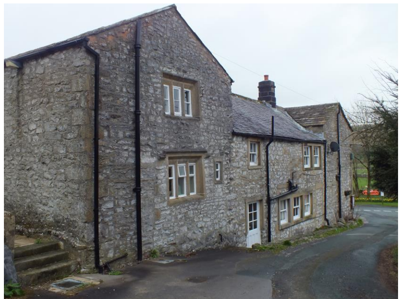
Figure 2 Tennant Arms: a 17th-century house is incorporated into the south side of a later public house.