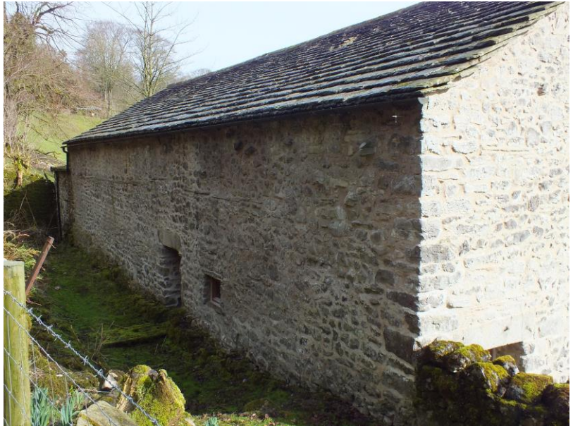
Figure 5 High Laithe: the rear west wall with building phases.

Jackson Close Laithe is a ruin that stands amongst the ridge and furrow of the former open field of Coulterlands, enclosed sometime before 1636 (Pacey 2015). The shippon lintel inscription 'LH 1715' marks an addition to an older