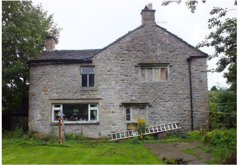
Figure 1 North Cote: the surviving 17th century south wing of the house.

rural economy. Cows were over-wintered in the barn along with their hay fodder cut from the surrounding meadows. In summer, as the meadow grass grew, cows were moved up to the higher pastures. So far, surveys reveal that most field barns have been enlarged, reflecting periods of farming intensification and increased grass yields. Outgang Laithe , set in Outgang Meadow , is one of the highest barns, at 260m OD, and stands on the edge of extensive earlier earthworks. It began as a three-bay building running down the hillside from west to east. There are some re-used cruck blades, quoins of limestone rather than sandstone, low and steep eaves for a thatched roof and a substantial boulder plinth, all indicating a former cruck-built barn of pre-1600 date. Further shippons were added to the south side. The low-end shippon was widened first, probably about 1700 with a fine wide-chamfered doorway, and the building received a heightened roof of sandstone flags, perhaps sourced from the